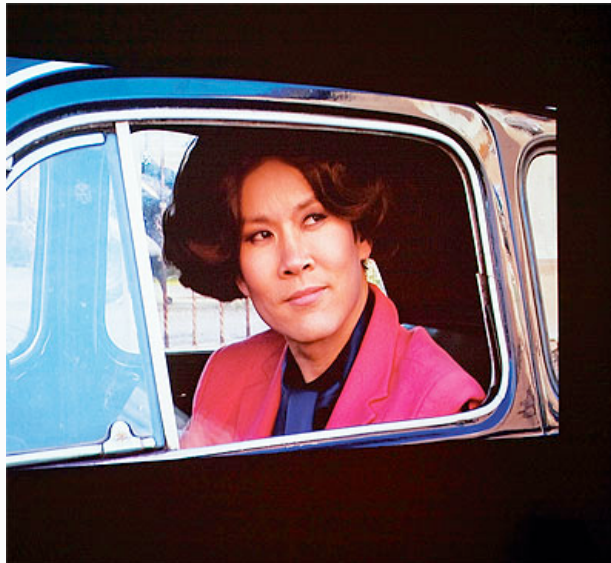
Devo partire. Domani/I must go. Tomorrow , 2010, starring Singaporean artist Ming Wong in the male and female roles.

The Singapore Biennale 2011 Open House runs until May 15. For more information, visit www.singaporebiennale.org .