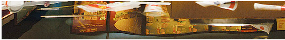
Superflex's Flooded McDonald's , 2008, which greatly relates to recurring catastrophes.

The Vietnamese artist raises issues of environmental degradation and global warming in her works. Growing up on the banks of the Mekong River, she experienced the 1978 historic flood which turned the river into a sea, and she could never forget the image of rising water.