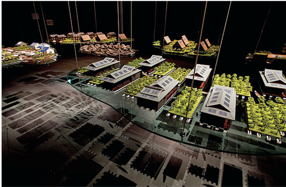
Stored in a jar: monsoon, drowning fish, color of water, and the floating world, 2010-11, by Tiffany Chung.

Of course, it wasn't a real McDonald's but a life-size replica created by Superflex, a trio of Danish artists who described the film as "a slow narrative of the destructive process, which we read and hear from the media every day."