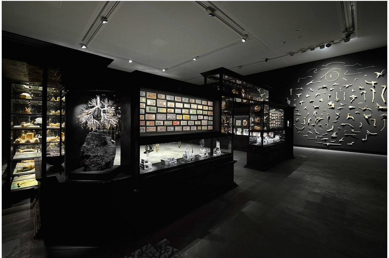
Fiona Hall, 'Wrong Way Time' (2015), installation

ensued with shows like Magiciens de la terre , the 1993 Whitney Biennial , or Enwezor's own Documenta 11 , all of which challenged contemporary art's monologue of sameness.)