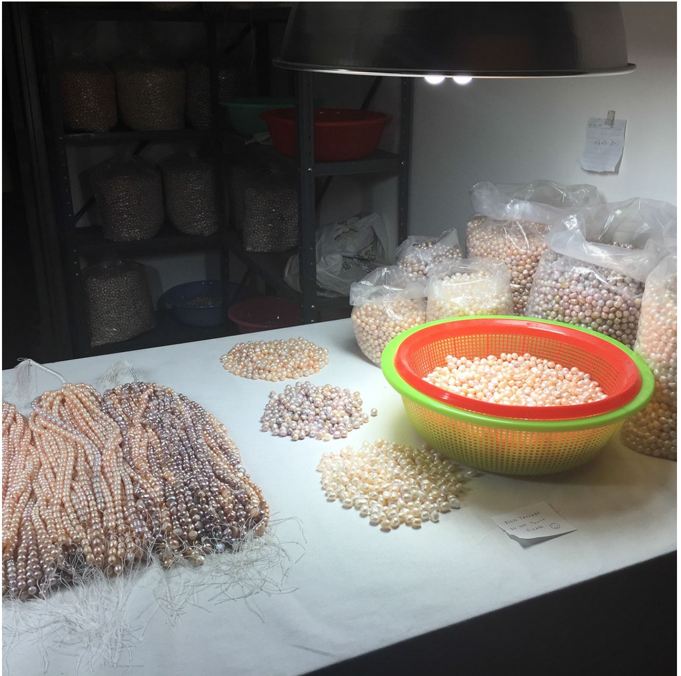
Mika Rottenberg, “NoNoseKnows” (2015), video and installation

While social concerns dominate Enwezor’s exhibition, there’s no dearth of politics elsewhere in the national pavilions and collateral events. The Australian pavilion is a case in point. Fiona Hall ’s Wrong Way Time is a Wunderkammer -like installation that brings together hundreds of disparate objects related to three intersecting concerns: global politics, world finance, and the natural environment. Hall sees in these subjects “a minefield of madness, badness, sadness, in equal measure,” and she has translated that into a phantasmagoric installation, knitting camouflage material into creepy heads that hang from the ceiling, shredding United States currency, weaving unspooled videotape, and integrating sardine and Coca-Cola cans, religious figurines, bones, credit cards, and cell phones into eccentric mini-displays. One corner features a collaboration with the Tjanpi Desert Weavers , a group of Aboriginal women from the central desert of Australia, who contribute a large sampling of gorgeous, hand-sewn animal figures that Hall has placed intermittently on stacks of black books (collectively titled “Kuka Iritija [Animals