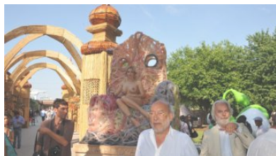
Seeing Through the Crowds at the 2011 Venice Biennale Part II: The Arsenal

The 2015 Venice Biennale continues at sites around Venice, Italy, through November 22.