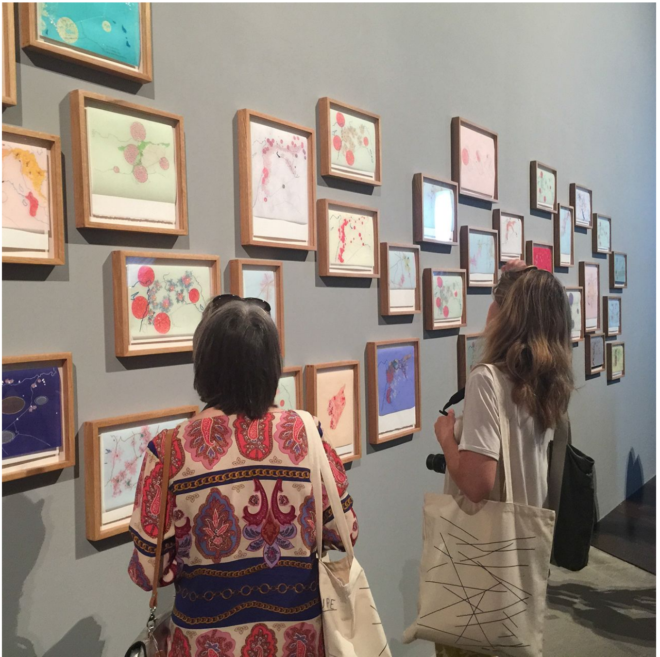
Tiffany Chung, 'Syrian Project' (2011–15), drawings

Taryn Simon 's installation "Paperwork, and the Will of Capital" (2015) presents a series of bouquets — pressed and photographed — along with corresponding texts derived from governmental agreements, treaties, and decrees. In historic photographs showing the signing of these documents, powerful men are typically flanked by magnificent floral arrangements. Simon has isolated these bouquets to mark their role as "silent observers" of man's determination to control the fates of nations and the natural world.