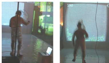
Egypt's Representative to Venice Biennale Was Killed in Tahrir Square