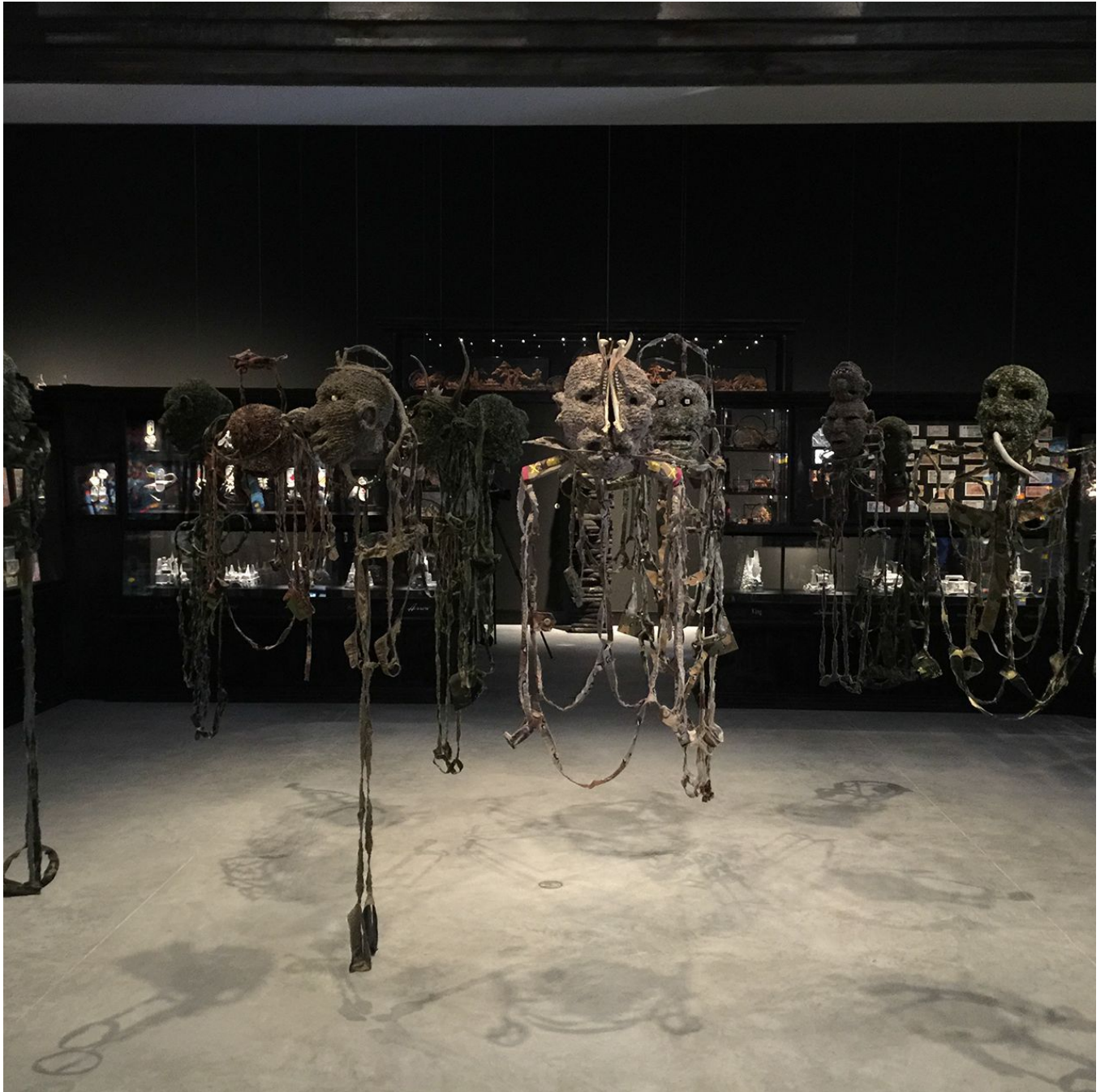
Fiona Hall, ‘Wrong Way Time’ (2015), installation

from Another Time],” 2014). These figures sit in relation to display cases full of everything from Chinese cork dioramas with live insects and painted world currencies to bread sculptures in the shape of animals and bones, plus grandfather clocks painted with symbols and logos (QR codes, Twitter), texts (“Endings are the new beginnings”), and accounts of nuclear explosions and meltdowns. While the work references the perilous state of the natural world and our corrosive effects on ecology, Hall hopes it is nonetheless “dark but ... witty.” It is.